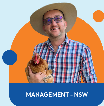
MANAGEMENT - NSW