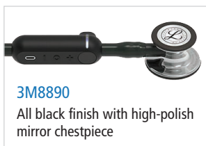
3M8890 All black finish with high-polish mirror chestpiece