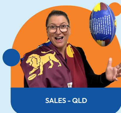
SALES - QLD