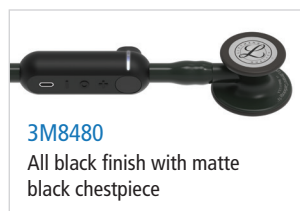
3M8480 All black finish with matte black chestpiece