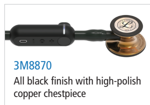
3M8870 All black finish with high-polish copper chestpiece