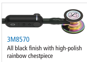
3M8570 All black finish with high-polish rainbow chestpiece