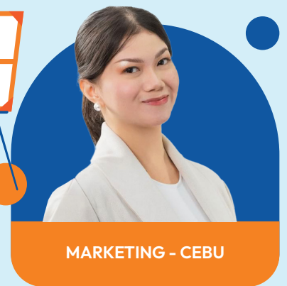
MARKETING - CEBU