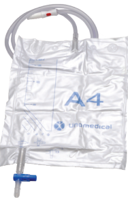
2000 ml A4 closed System Bag with Kombikon

Choose our experienced team for your Practice Set-Up. Call us to discuss your set-up requirements. We can help throughout the entire process.