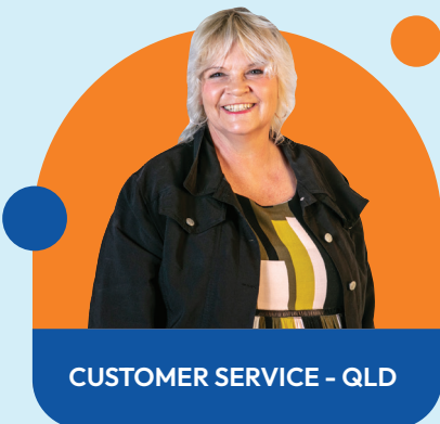
CUSTOMER SERVICE - QLD