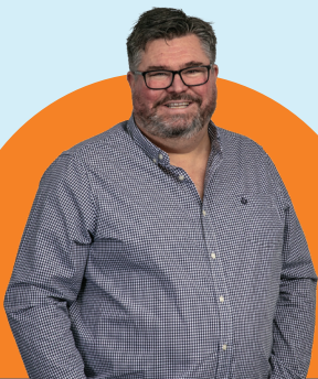
SALES - VIC