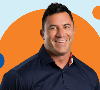
SALES - QLD