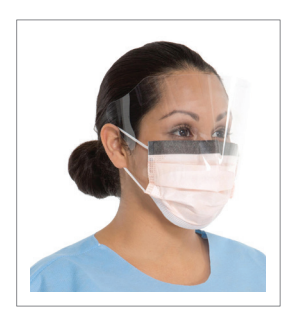
KC47147 Box/25 $52.95