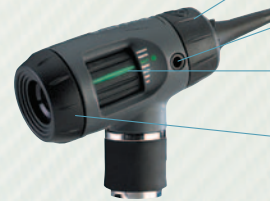
Tip Grip: Ensures ear specula are fastened securely and easily