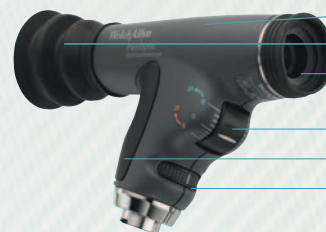
Axial PointSource™ Optics