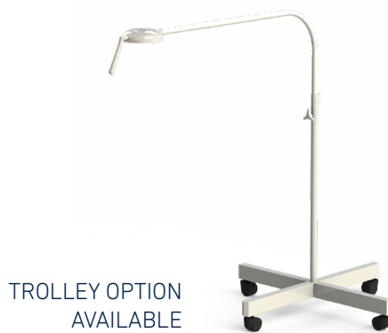
TROLLEY OPTION AVAILABLE

FlexLED is designed and manufactured entirely in Australia and built to conform to and exceed rigorous Australian standards and testing.