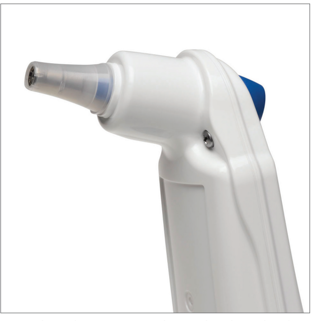
Ensure the probe cover is securely seated on the probe. The silver probe should not be showing. A probe cover MUST be used.