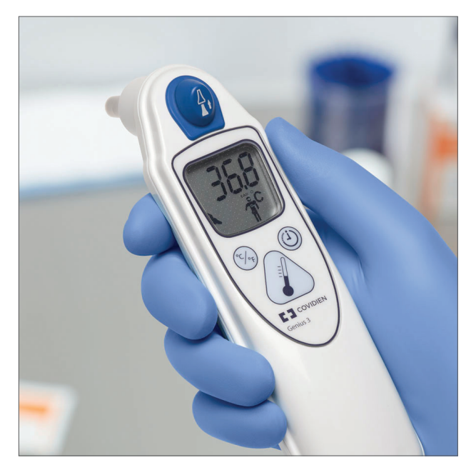
To recall the last temperature, press and release the scan button before loading another probe cover. Loading a new probe cover will erase the last temperature taken from the memory.