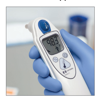
To change the temperature display, press and hold the Co/Fo button for 2 seconds when the LCD screen is active.

Use ONLY the approved cleaning methods outlined in the Operating Manual.