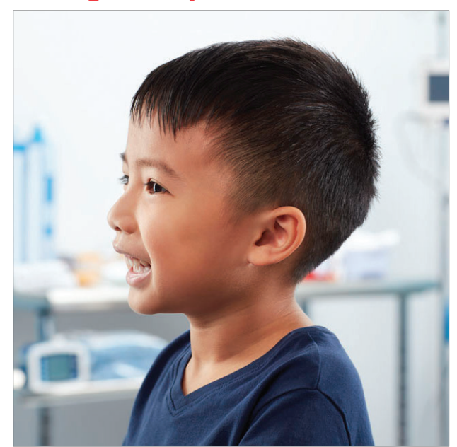
Inspect the patient's ear anatomy for proper probe placement. (No blood or fluid should be present.)