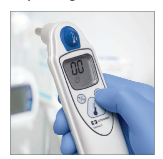
To use the 60-second pulse timer, press and hold the clock icon button for 2 seconds to activate.