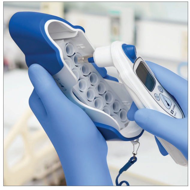
Attach a probe cover by aligning the silver tip with a probe cover and push straight down until you hear a snap. Inspect the membrane on the end of the probe cover. If a hole or tear is visible, discard and attach a new probe cover.