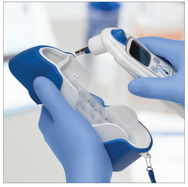
Return the thermometer to the base unit for storage. The LCD display will go into "sleep" mode after 10 seconds of inactivity.