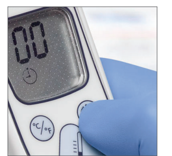
Press and release the clock icon button once to begin. (Beeps will be heard at 15-second intervals.) The thermometer will automatically shut off at 60 seconds. If finished before a full 60 seconds, press and release the clock icon button again to deactivate.

© 2018 Cardinal Health. All Rights Reserved. CARDINAL HEALTH, the Cardinal Health LOGO are trademarks of Cardinal Health and may be registered in the US and/or in other countries. 03/2018 - H9950 - WF#776288