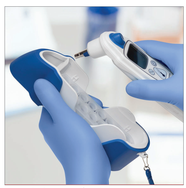
Remove the thermometer from the base.