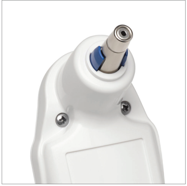
Inspect the probe lens. It should be shiny and free of cracks or debris without a probe cover attached. (Clean lens with a dry lint-free swab or lens wipe if needed.)